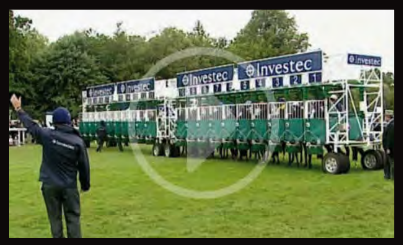
Derby Stakes, 12f, Epsom, in June.