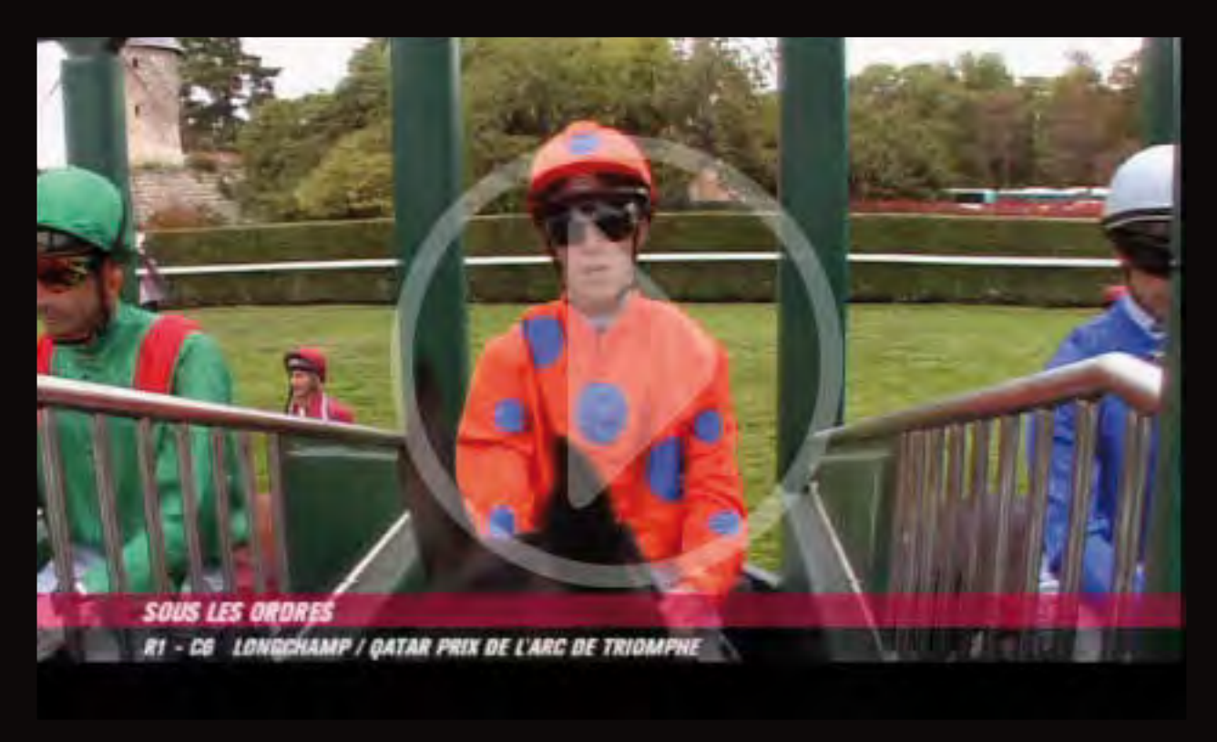
Prix de l'Arc de Triomphe, 12f, Longchamp, in October.