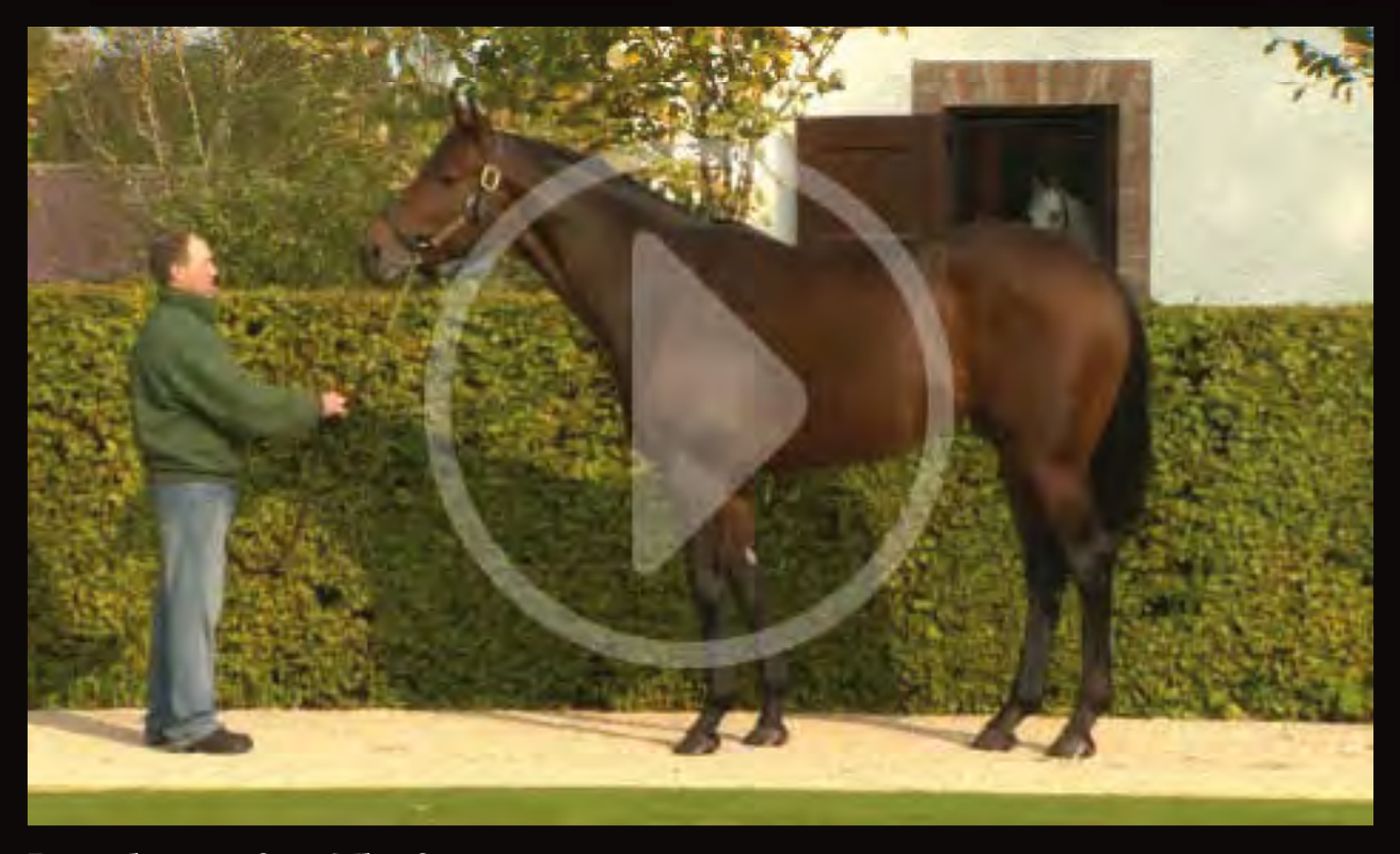
Introducing Sea The Stars